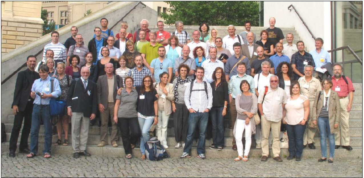
Most of the delegates at the Eighth COLOSS Conference, Halle, Germany.