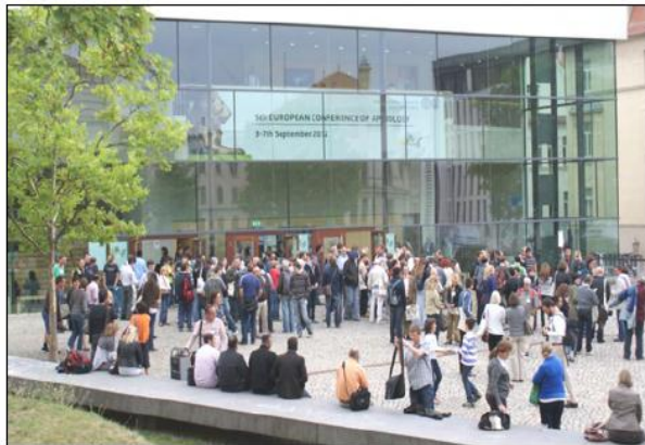
The Audimax complex in the centre of Halle which was the venue for the EurBee Congress in September.